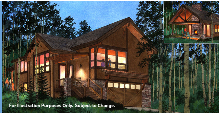
For Illustration Purposes Only. Subject to Change.

2,500 sq ft | 4 Bedrooms | 3.5 Bathrooms