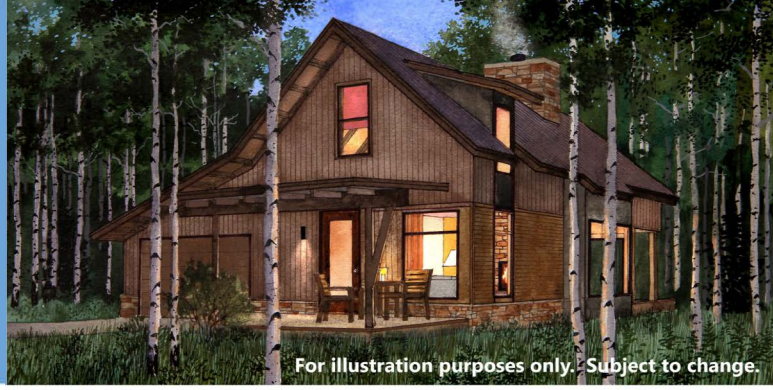
For illustration purposes only. Subject to change.

2,720 sq ft | 4 Bedrooms | 4.5 Bathrooms